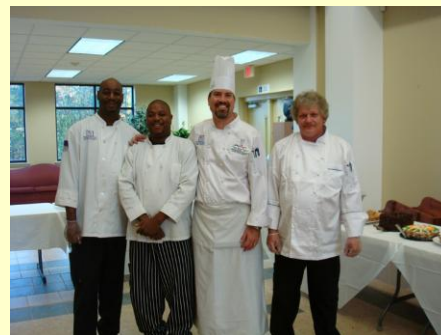
Triad Community Kitchen Chefs