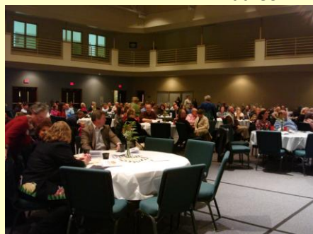
Those who came to enjoy!